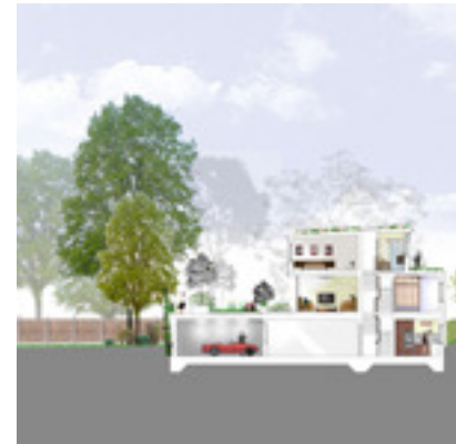
Illustration courtesy of Studio Sutherland

Construction on site is anticipated to start late 2009.